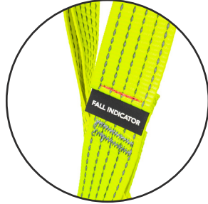
Rip stitch indicators