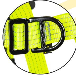
Front attachment point