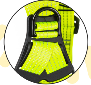
Rear attachment point