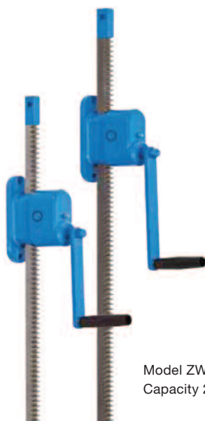
Model ZWW-L Capacity 250 and 500kg