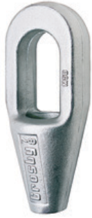
G-417 / S-417

Closed Grooved Sockets meet the performance requirements of Federal Specification RR-S-550, Type B, except for those provisions required of the contractor. For additional information, see page 452.