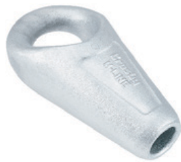
G-517 Mooring Spelter Socket