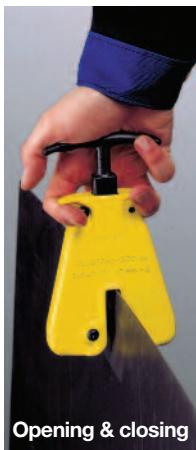
Opening & closing