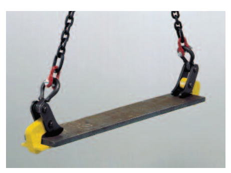
*Chain slings NOT included