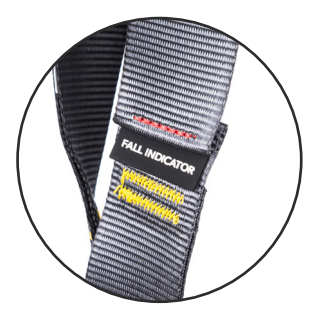
Rip stitch indicators