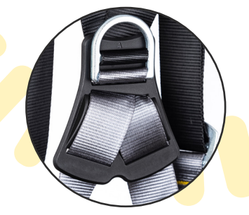
Rear attachment point